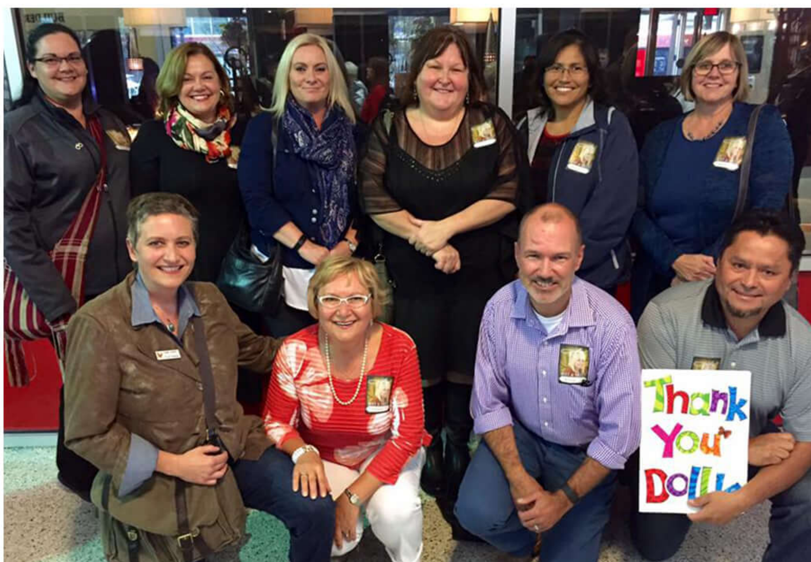
Community Partners in Winnipeg, MB

Dolly Parton's Imagination Library puts books into the hands and hearts of children across the world. We partner with local communities to provide a specially-selected, age-appropriate, high-quality book each month to registered children from birth to age five. These books are personalized with the child's name and mailed directly to the child's home to create a gifting experience that makes books exciting and shows the child someone is thinking of them.