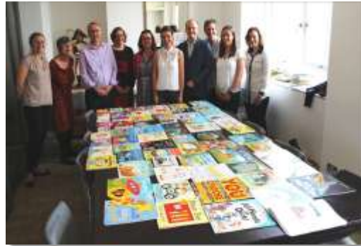
Dolly Parton's Imagination Library UK Book Selection Committee

Funding provided by the players of the People's Postcode Lottery