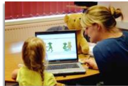
University of Liverpool Testing and Evaluation