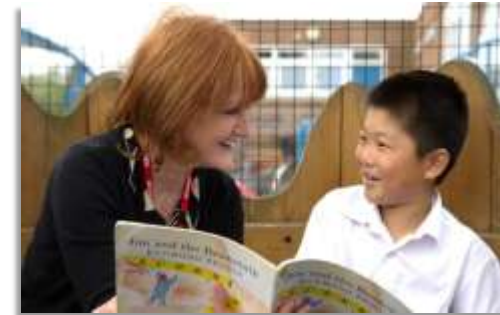
Beanstalk One-To-One Reading Support