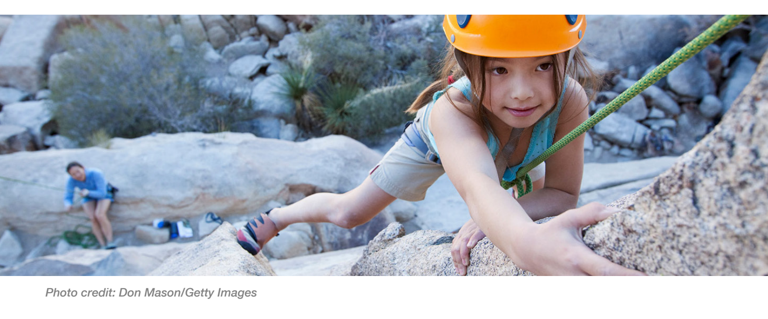
Few things are as inspiring as seeing children learn a new skill — be it

walking, swimming, riding a bike, navigating social situations, or a number of other important accomplishments. We nurture children, and they in turn surprise us with skills they seem to have mastered overnight. Fortunately, for today's modern parents and educators, the wealth of resources available to support strong girls is something that scarcely existed even a decade ago. Giving young girls (and boys) positive role models that encourage their natural interests and talents is one of the best ways we can help children succeed (and cope with inevitable failures along the way). This list of both fiction and nonfiction picture books showcases a variety of diverse young women, who each make contributions that break stereotypes and forge new frontiers. May these nine books inspire you to continually strengthen and encourage the adventurous young people in your life.