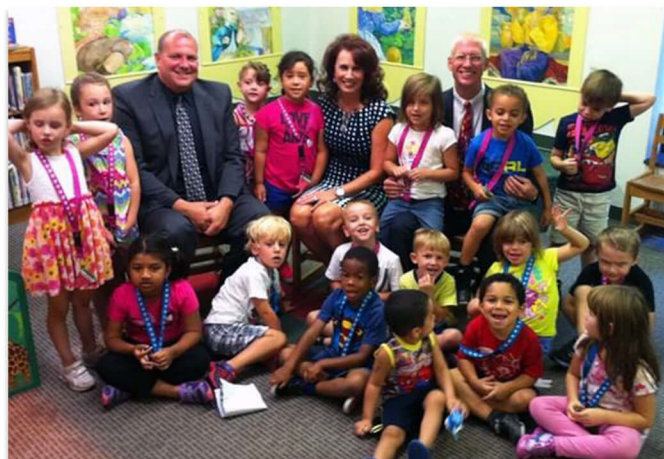
United Way of Wyoming Valley

Dolly Parton's Imagination Library is a dependable partner for local communities and provides a low-cost, turnkey program to help young children develop a love for books and reading.